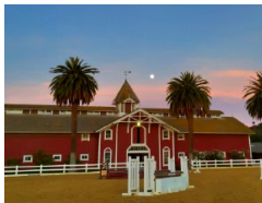
The Barn & Farm Walking Tour