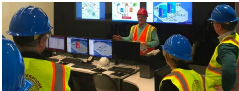
Stanford Central Energy Facility