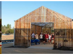
Stanford Recycling Center